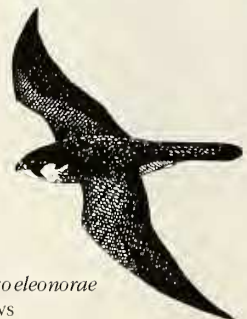
Eleonora's Falcon Falco eleonorae

Vagrant. Eight records: Oct–Feb Aldabra 6, Aride 1, Cousin 1 (10).